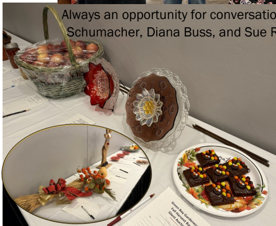
Delightful donations were made for our silent auction—nonhardy bulbs, decorative garden objects, apples, brownies, toffee, wine, and more.